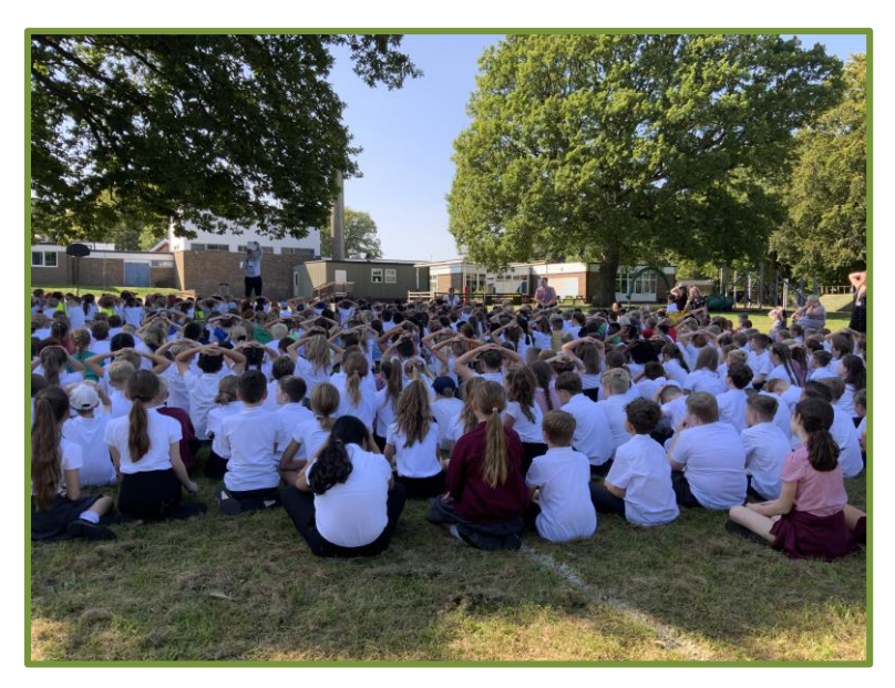
OUR FIRST WHOLE SCHOOL ASSEMBLY

Once again, thank you for your support at the start of another exciting school year and we very much look forward to working with you going forward.